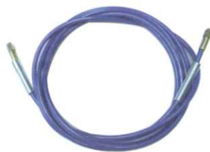
High Pressure Hose